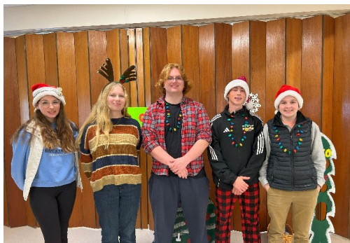
Youth Volunteers at Breakfast with Santa