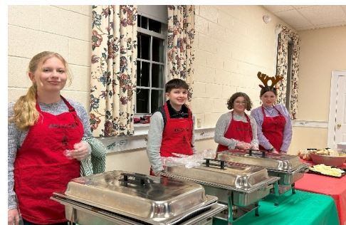
Youth Volunteers at the Lions Spaghetti Supper