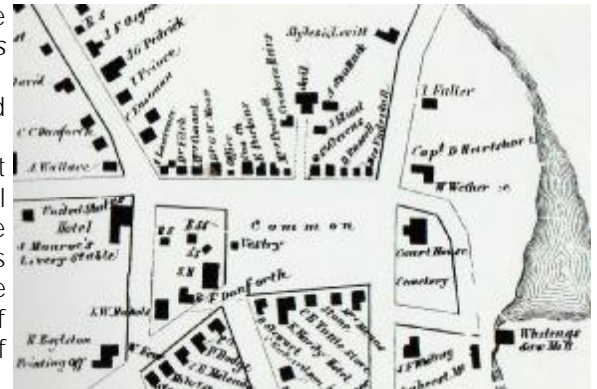
Map of Amherst 1858

See also: http://freedomsway.org/amherst-nh-town-common/