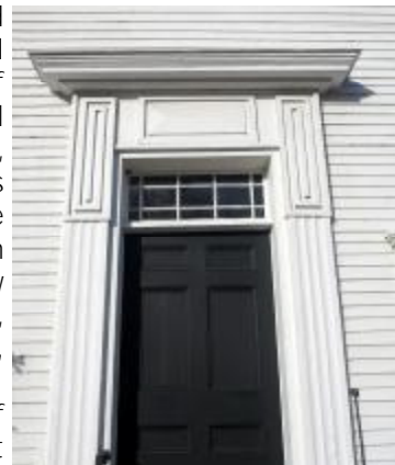
One of three front doors to the church showing the molding.

Because of the porch roof, there was not room for a transom window over the door. The handsome wide moldings and panels indicate that this was a well-built house for the time. The windows are original with mostly original glass.