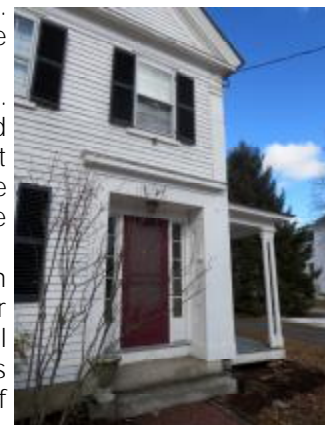
Parsonage front door.