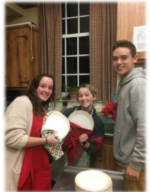
Helping the Lion's Club and Community Supper clean up