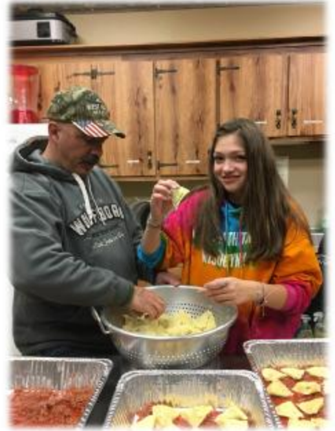
Making lasagna's for Anne-Marie House

This is a trial run, so let us know what you think!! Feedback is ALWAYS welcome.