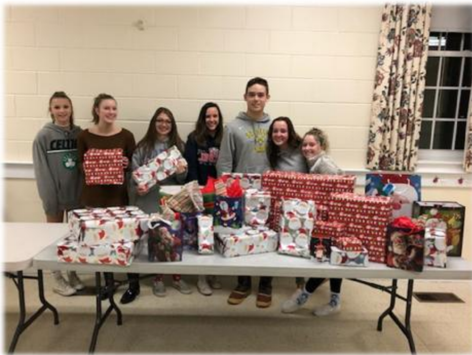
Wrapping presents for Santa's visit to Anne-Marie House!