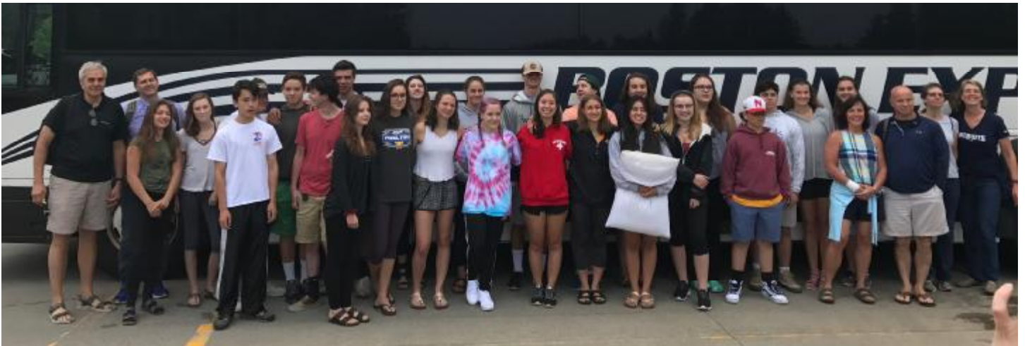
2017 SHYG mission trip participants

20 dedicated youth are going on the trip, along with 6 (also dedicated!) adult chaperons, June 17-23.